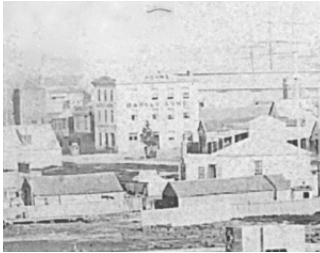
1871 (Barkly Hotel)