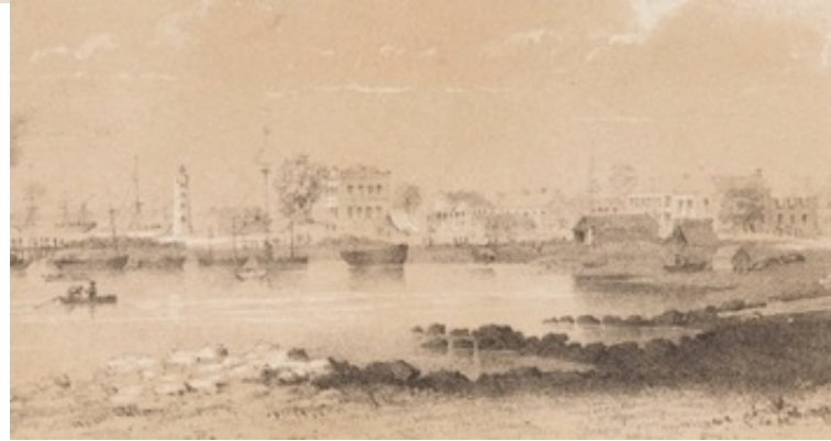
1863 (Barkly Hotel)