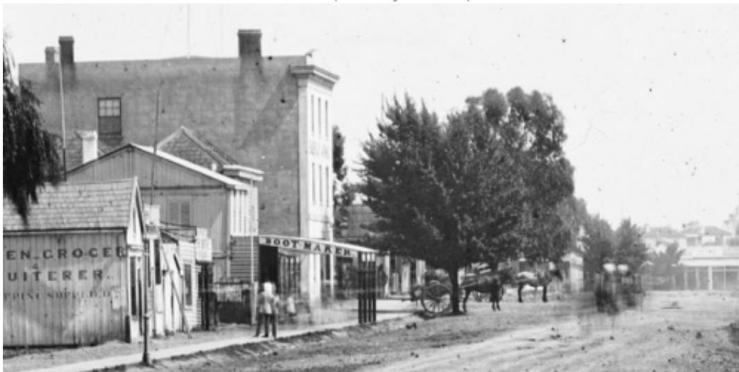
1904 (Oriental Hotel)